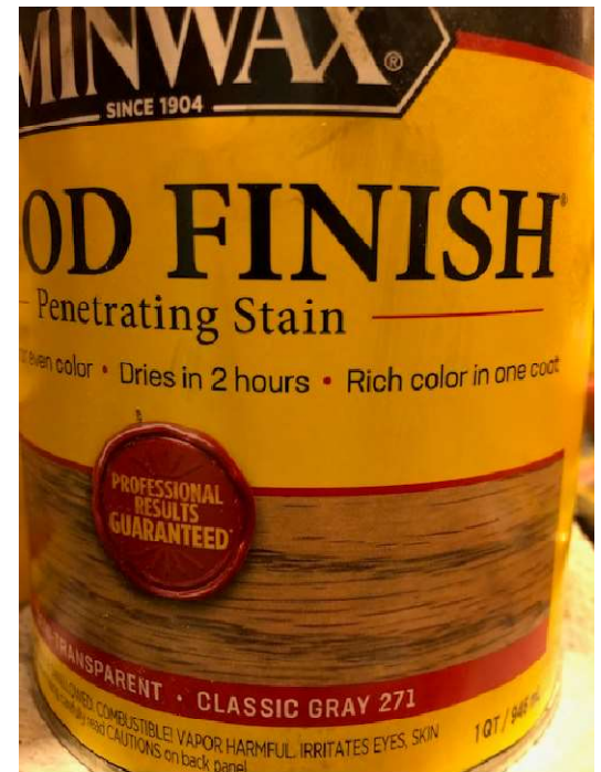
Classic Gray 271