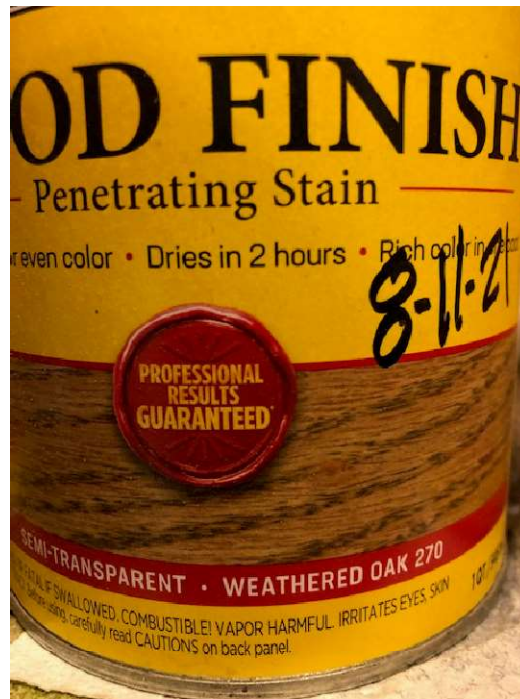
Weathered Oak 270